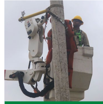
LeMonds, mounts the practice dummy to the training pole.