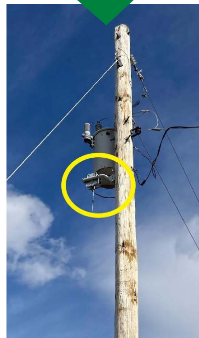
This device helps boost the signal from our meters back to our office.

Over the next few months, the line crew will be installing communication equipment as part of the metering project. This will require them to visit numerous locations across our system - so, if you see them working near your property the device they are installing will help boost the signal from our meters back to our office.