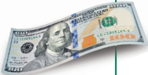
BASED ON A $100 BILL