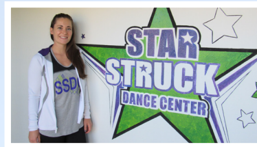
Starstruck Dance Center - Manson, Iowa