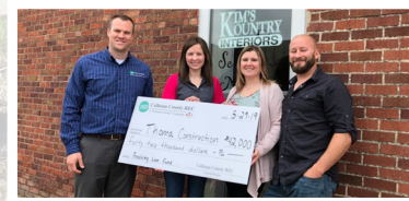
Thoma Construction - Manson, Iowa